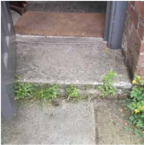
There are two steps to enter the chapel. The first step is 22mm, followed by a 12mm step

The flooring in the entire Greyfriars Chapel is wooden. Please be aware that the flooring is uneven and can be slippery.