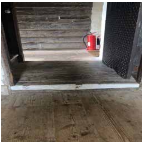
There is a 10mm step to enter the prison.