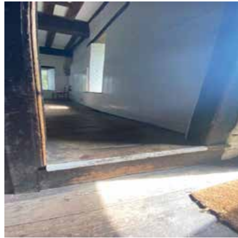
After entering the Chapel, the room on the right-hand side has a 21.5mm step